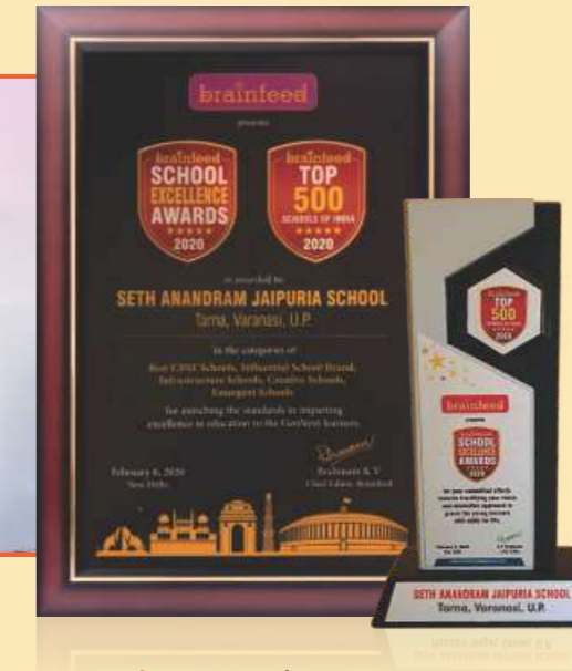
Seth Anandram Jaipuria School, Varanasi is rated among Top 500 Schools of India by Brainfeed School Excellence Awards, 2020