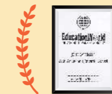
Ranked No 1 in Ghaziabad by Education World, 2020-21 Seth Anandram Jaipuria School, Ghaziabad