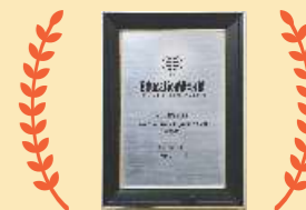
Ranked No. 2 in Kanpur and No. 3 in UP by Education World, 2020-21 Seth Anandram Jaipuria School, Kanpur