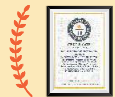
Recognition by GUINNESS BOOK OF WORLD RECORDS, 2019 Seth Anandram Jaipuria School, Lucknow