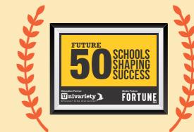
One of the Future 50 schools of India, 2018-19 & ISO 9001:2015 CERTIFIED Seth Anandram Jaipuria School, Kanpur