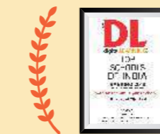
Ranked No 1 in Ghaziabad by Digital Learning, 2019 Seth Anandram Jaipuria School, Ghaziabad