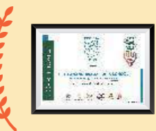
Inspiring Climate School Award, 2019 Seth Anandram Jaipuria School, Lucknow