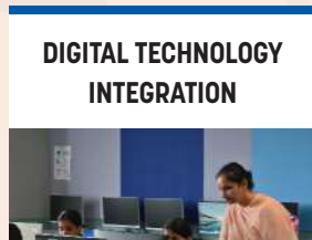
DIGITAL TECHNOLOGY INTEGRATION