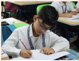
STUDENT CENTERED LEARNING